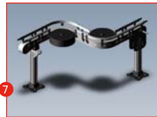
table top conveyor