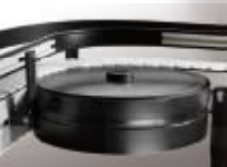
aluminium system with sliding and wheel curve

configurations. The chain design permits horizontal as well as vertical change of direction. Chain widths range from 80 up to 200 mm, for product widths up to 400 mm. Each system consists of a wide range of modular components which can be fitted using simple hand tools.