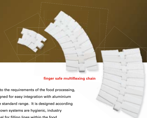
finger safe multiflexing chain