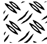
Duett two bars