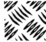
Quintett five bars