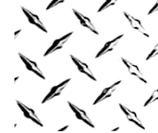
Mono one bar