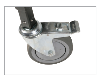
150mm x 50mm Swivel Castors For easier rolling over uneven surfaces. Adds 23mm to conveyor height.

Prevents cartons from running off the conveyor in accumulating applications.